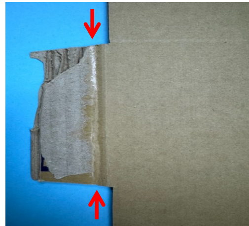
VISIBLE NICK MARK ON HORIZONTAL POSITION CROSS GRAIN DIRECTION